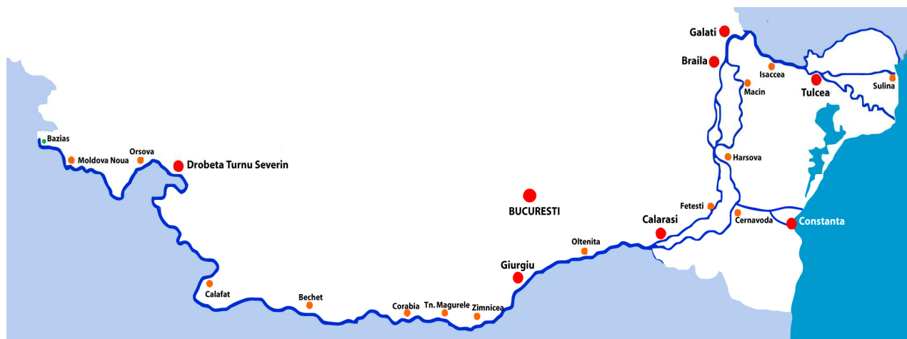
The Romanian Danube

With high potential to develop intermodal hubs along the Danube, due to the connection to the Black Sea (assured by the Danube Black Sea Canal), the Danube plays a major role in serving the transport of cargoes coming from Far East and dedicated to Central and Eastern European countries.